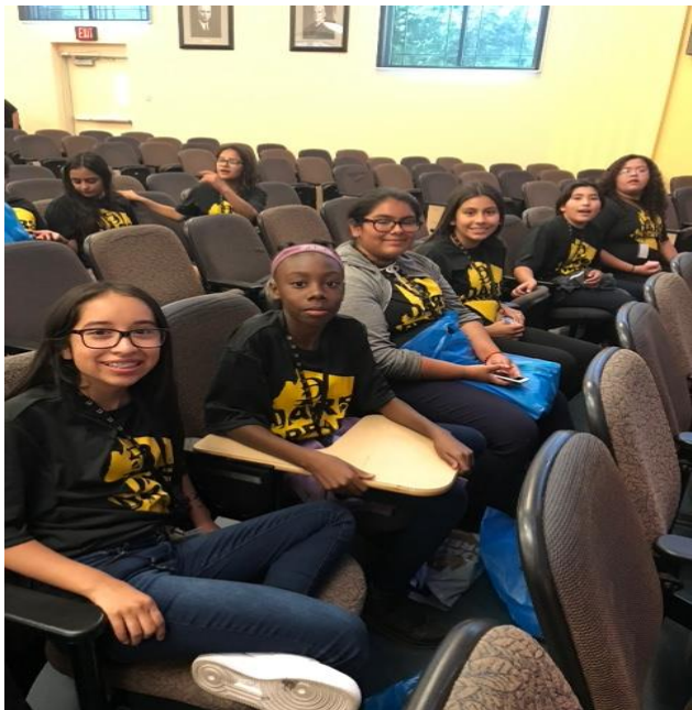
Dare to Dream- DH Students!