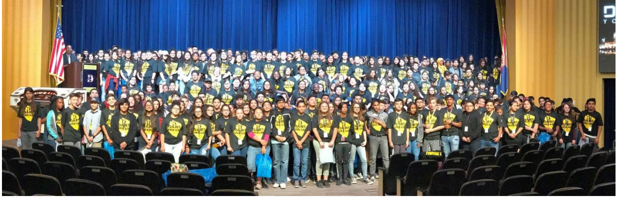
Dare to Dream Conference Group Photo- Our 7 th Grade Stand Up / Speak Up / Save a Life Team attended!