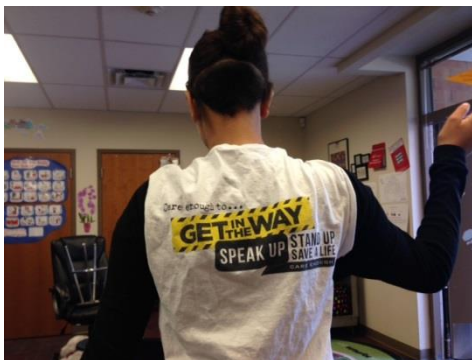
C:\Users\cthogersen\Downloads\IMG_3363(1).MOV (Movie for Quick Tips Staff / Student )